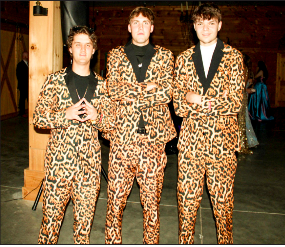
A tight group of friends all dressed in the same leopard print suits for prom this year, being introduced during the Senior Walk as "The Leopard Boys."