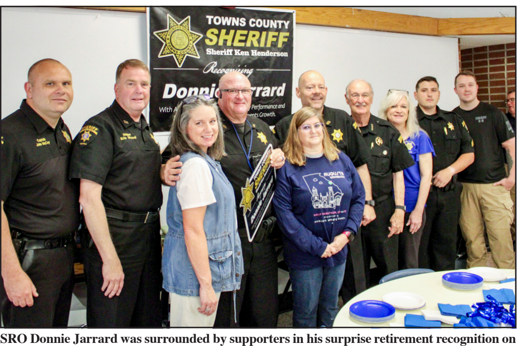
campus last Wednesday.