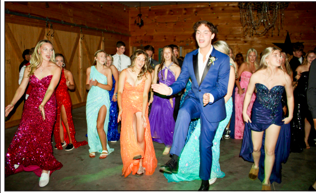
Seniors and juniors had a blast dancing at Prom 2024 in the beautiful venue of The Barn at Young Harris.